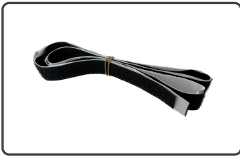
1 x Hook tape/top strip