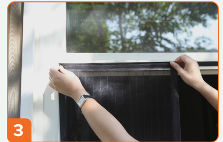
3 Align and attach the left side panel of door curtain to top strip.