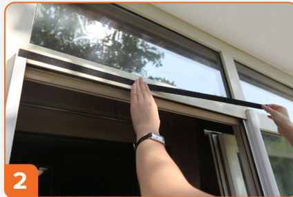
2 Carefully attach the top strip horizontally.