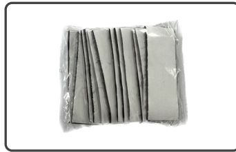
1 x Pack of side hook tape tabs